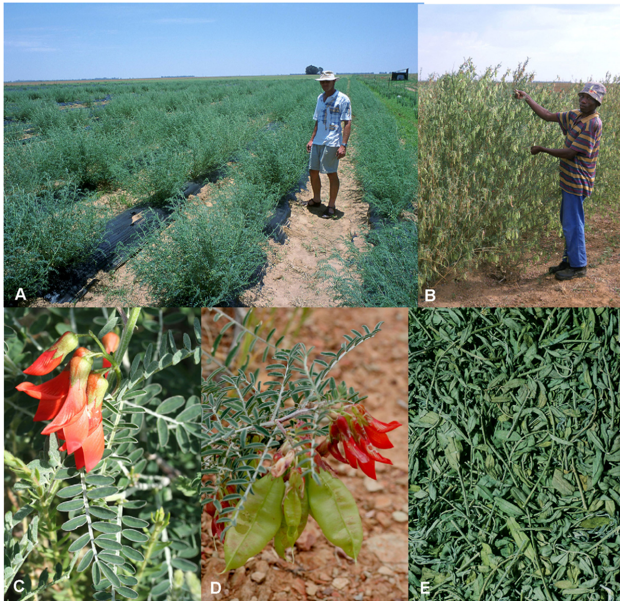
Fig. 1. Sutherlandia frutescens . (A) Commercial plantation; (B) fruiting plant of commercial type (“subsp. microphylla ”); (C) flowers of “subsp. frutescens ”; (D) flowers and pods of “subsp. frutescens ”; (E) dried product (sutherlandia herb).

Recently, Goldblatt and Manning (2000) proposed an alternative classification system by transferring Sutherlandia to the genus Lessertia DC., presumably on the assumption that Sutherlandia merely represents an adaptation to bird pollination. The two genera are similar and probably also closely related, but it remains to be demonstrated (by morphological or genetic analysis) that Sutherlandia is indeed nested within Lessertia . If the two taxa prove to be sister groups in a cladistic sense, then the traditional generic concepts should be retained. The transfer of Sutherlandia to Lessertia by Goldblatt and Manning (2000) necessitated a new name for Sutherlandia tomentosa . The correct names for the two species in Lessertia are therefore L. frutescens (L.) Goldblatt & J.C. Manning and L. canescens Goldblatt & J.C. Manning. In the interest of nomenclatural stability, it is recommended that the conservative option be followed (see Germishuizen and Meyer, 2003; Klopper et al., 2006).